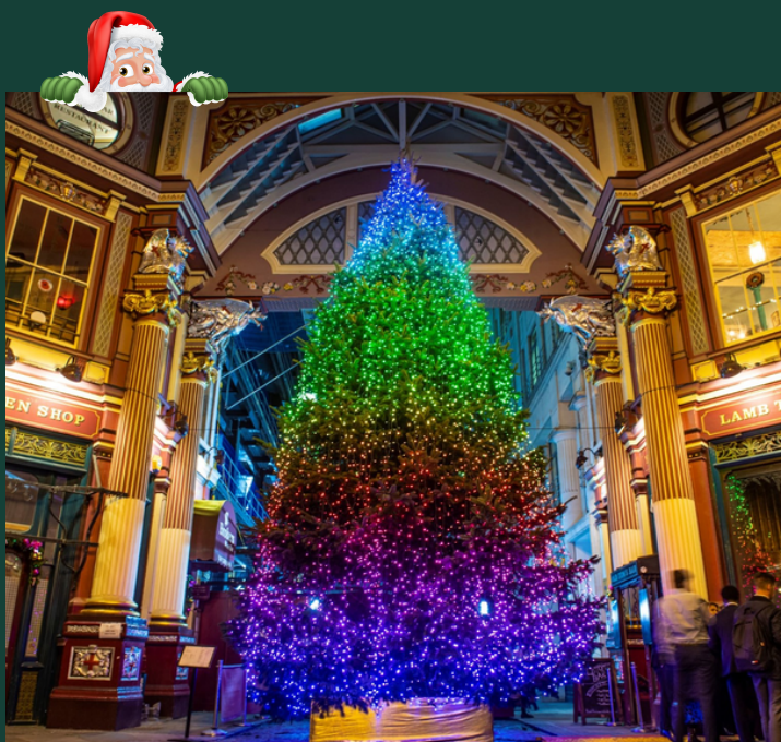
Leadenhall Market.